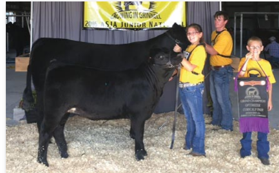
AJP Tiana 2218A and her daughter, Lot 24, KM Tiana's Penelope 13D as cow-calf pair