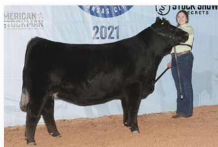
KM Tiana's Gucci 925G – dam of KM Gucci's Kickstart 201K, service sire of Lots 33 and 34