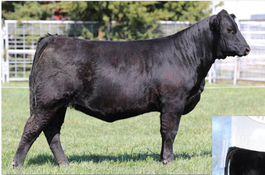
Lot 1 – NCS Glamorous Keepsake 228K (left) & full sister NCS Glamorous Katrina 227K (below), who was recently named senior calf champion at the American Royal.