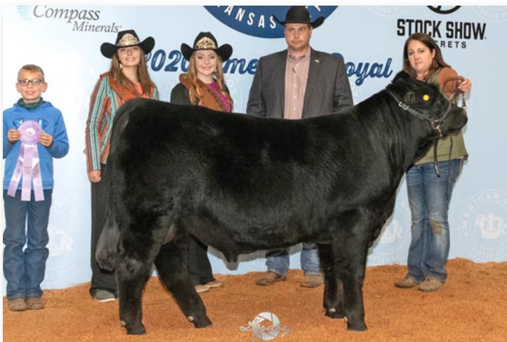
Reference Sire – KEG Tootsie's Pay Day 03H