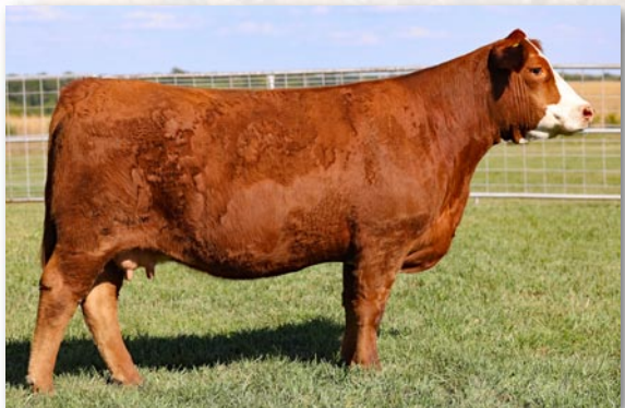
Lot 10 – HA Lady Blk Cherry 824F