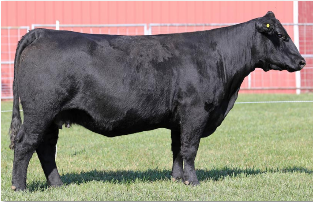
Lot 9 – KG Evelyn's Luna 922G