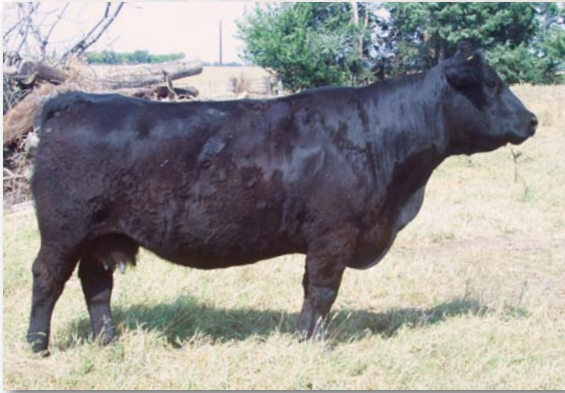
Lot 25 – KG Miss Daisy 283C