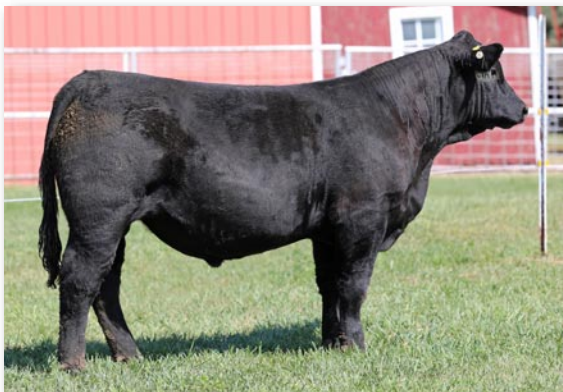
Lot 13A – NCS 003H's Lead The Way 311L