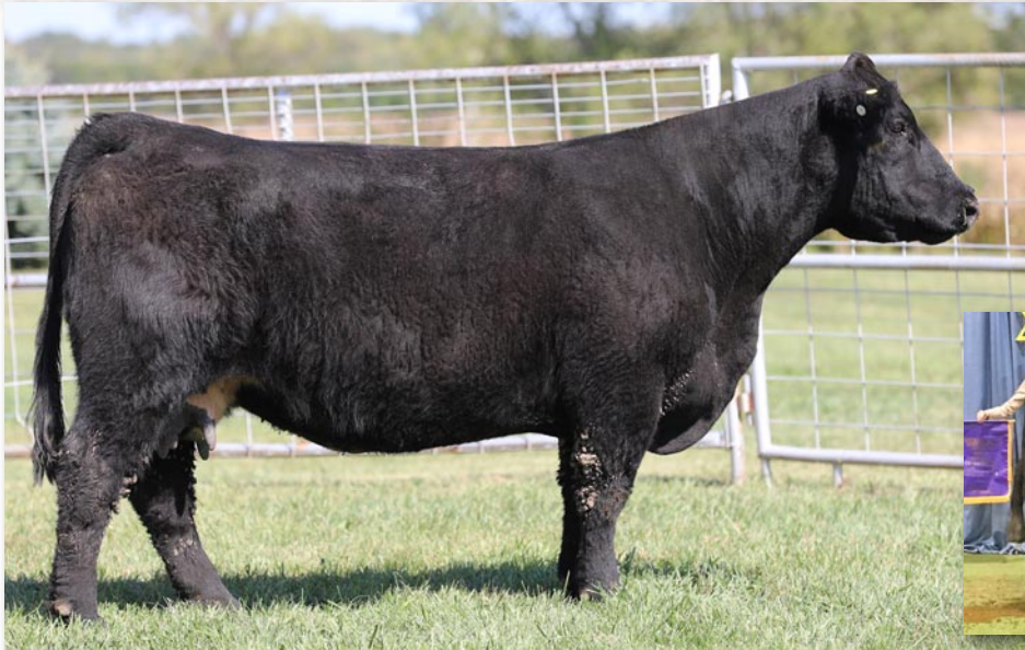
Lot 23 – TSB She A Thriller U1B and below as 2016 National Champion Percentage Female