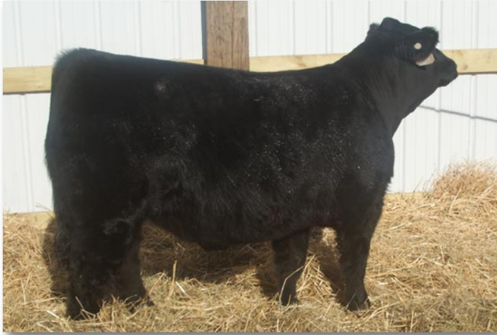
Reference Sire – KG Exodus Flint 810F