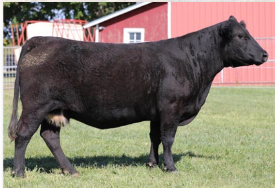
Lot 11 – RAO Miss Ella 729E