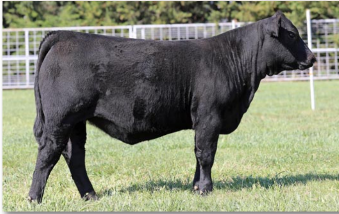
Lot 4 – KG Violet's Legend 314L