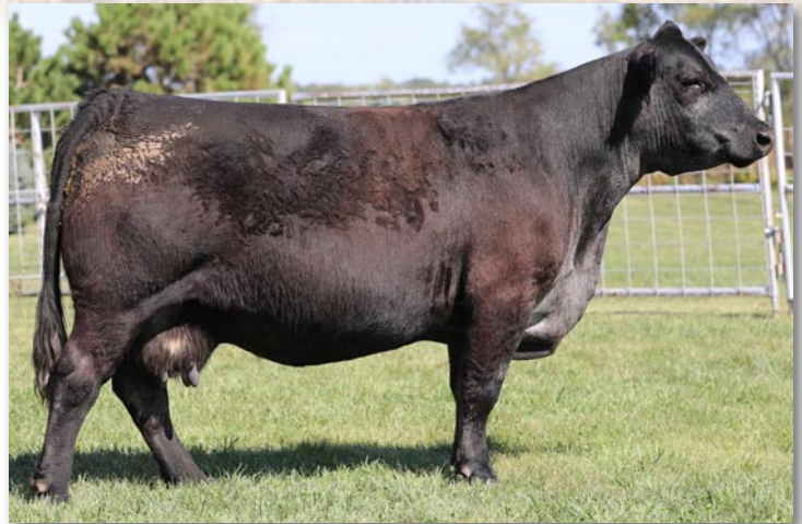
Lot 13 – SE Ms Vision 15A