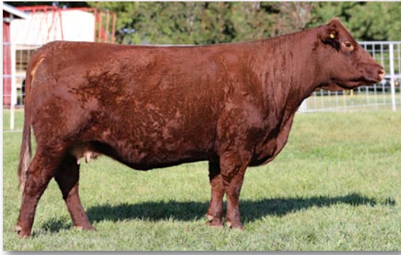
Lot 12 – HA Sara D620