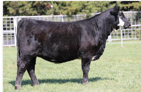
Lot 3 – NCS 231K