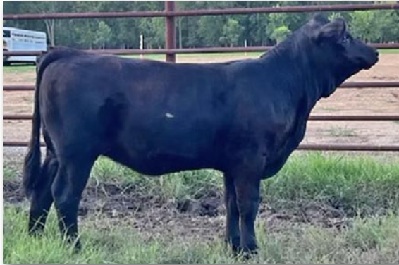
Lot 40 – CLK Lainey 314L