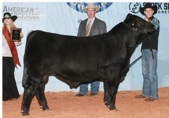
KG Evelyn's Earl 025H – son of Lot 22. He was 2022 National Champion Percentage Bull