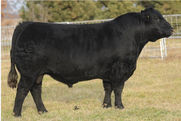
Reference Sire – NCS HA Earl 701E