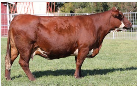
Lot 18 – B4126