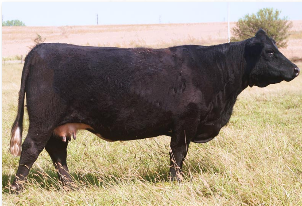
Lot 21 – Lady Elsie KM 703E