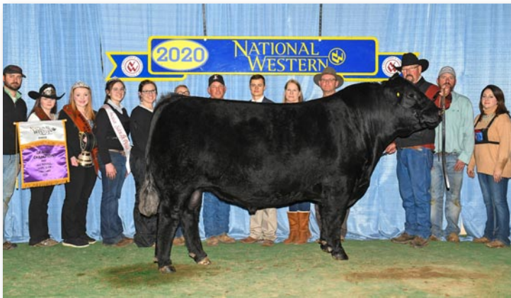
NCS HA Earl 701E – 2020 Salers National Champion Sire or grandsire of many of the lots in this sale.