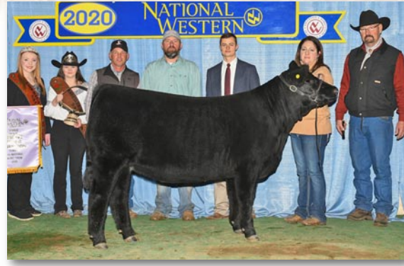
RAO Miss Eva 19E – Paternal granddam of Lot 42 as 2020 National Reserve Grand Champion Salers