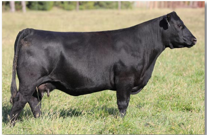
Lot 20 – BCC First Lady 801F