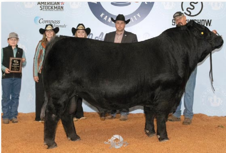
Reference Sire – KJM Ferdinand 801F