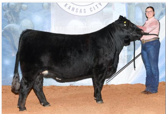
Elsie's Lady 126J – Daughter of Lot 21, Lady Elsie KM 703E

Lot 21A – Polled 7/8 SA, 1/8 XX black heifer calf, KM Elsie's Lorelei 331L (P757173), calved 10/2/2023, birth wt. 67 lb., tattoo KM331L, sired by KEG Tootsie's Pay Day 03H.