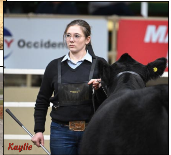
The family with KM Earls Jordon 121J, 2022 Denver Spring Calf Champion. Selling a flush on his dam as Lot 17.