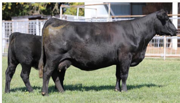
Lot 34 – BCC Beauty 503C