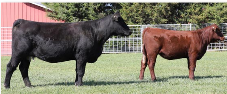
Lot 33 – BCC Harmony 004H and her calf, Lot 33A – BCC Lily 307L