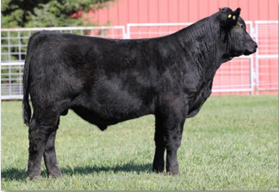
Lot 29 – KM Earl's Lean on Me 321L