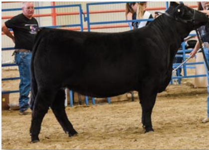
NCS Eva's Fergie 817F – Dam of Lot 5