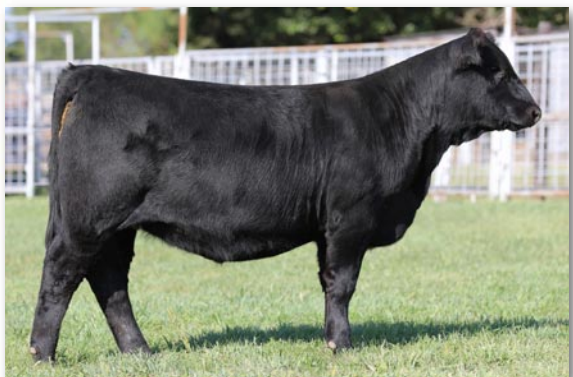
Lot 10A – KM Cherry's Lily 318L