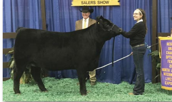
KM Tiana's Francesca 803 – Optimizer Champion at NAILE and dam of KM Earl's Lottery 303L