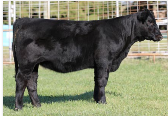
Lot 8A – KJM Jade's Libby 316L