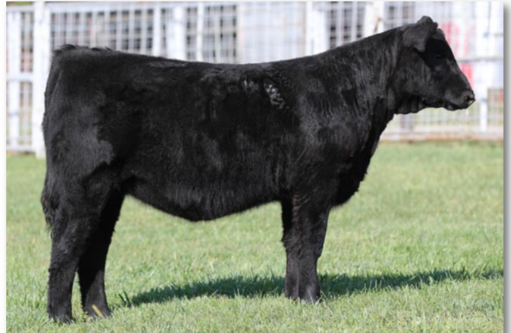
Lot 9A – KGS Luna's Lyric 324L

Remember, the Junior National will be held in late June 2024 at McPherson, KS. There are some great show prospects here in this sale. We hope to see you juniors and your Ladies Nite purchases in McPherson in 2024!!