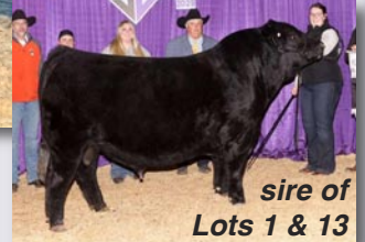
sire of Lots 1 & 13