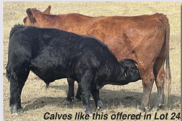
Calves like this offered in Lot 24