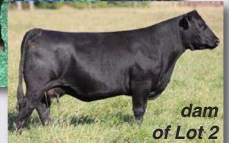
dam of Lot 2