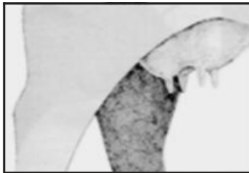
7 - tight, fairly level