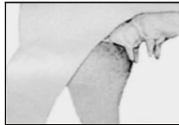
7 - small