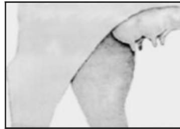
9 - very small