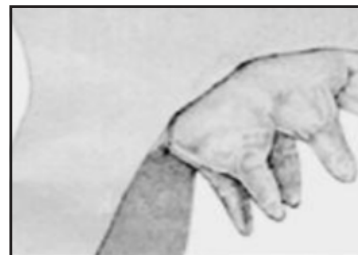
3 - large