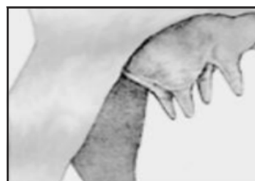
1 - very large, balloon shape