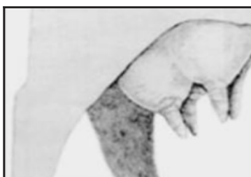
1 - very pendulous, broken floor