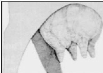
3 - pendulous, broken floor