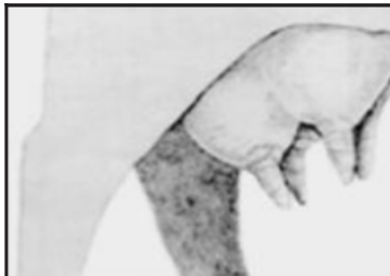
5 - moderately tight