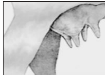
5 - intermediate