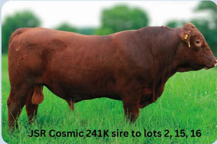
JSR Cosmic 241K sire to lots 2, 15, 16

This replacement heifer is out of a well uddered cow. She is sired by our top selling bull from our 2025 sale. Pasture exposed to SE Black Ninja N8 (LOT 4) from 1-14-2026 to 3-15-2026. Preg status available sale day.