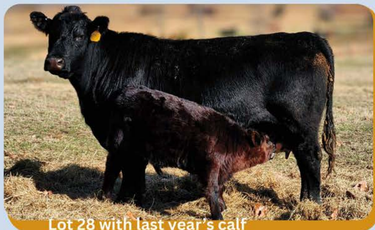
Lot 28 with last year's calf

This cow is sired by our 2020 NWSS Grand Champ Bull. She has at side a potentially homo black polled bull calf (BW 70) by TSB Sarge 1L born 2-11-2026. Her 2025 heifer calf has been retained. We have used her as a recip cow.