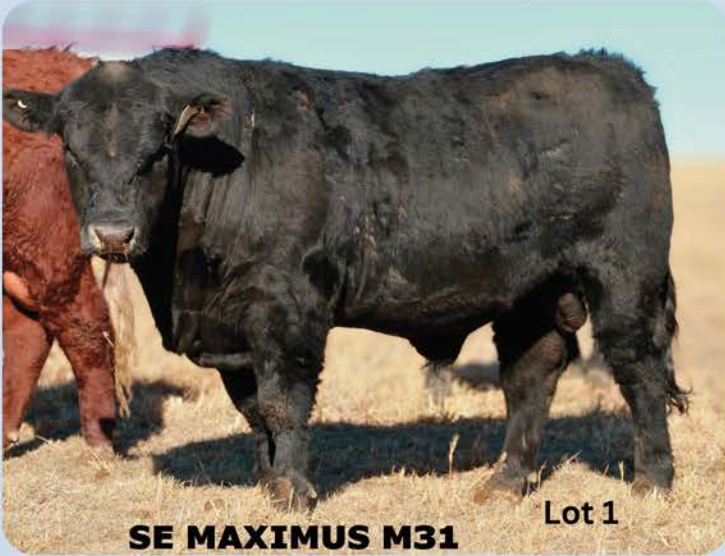
SE MAXIMUS M31