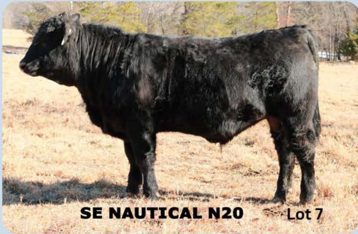
SE NAUTICAL N20 Lot 7