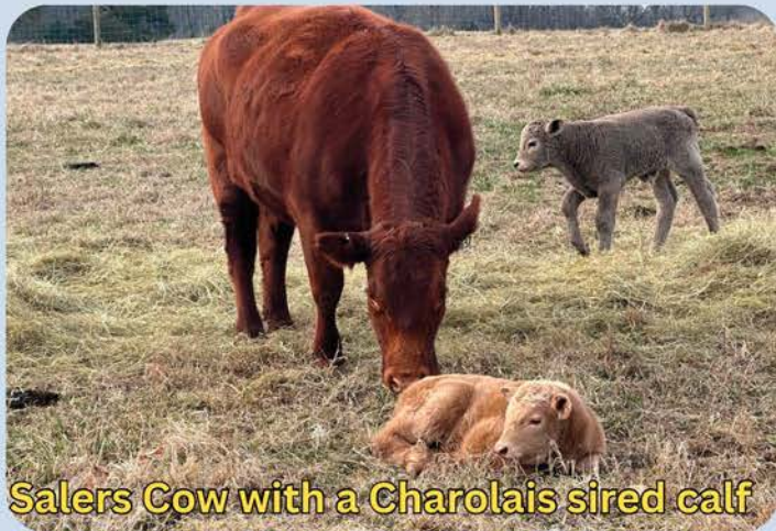
Salers Cow with a Charolais sired calf

51J has been a very fertile female as she has given 2 AI calves. We used her as a recip cow last year. She is natural serviced to our former herd sire TSB Sarge 1L to give a Spring homo black polled calf. Preg status available on sale day.