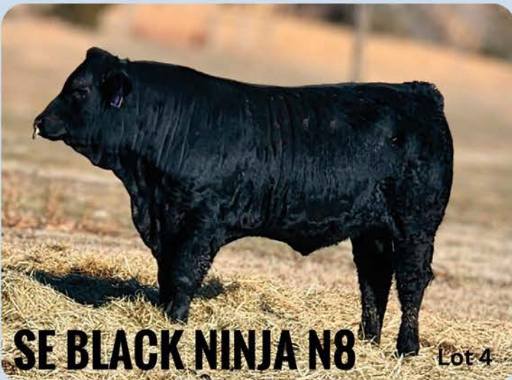
SE BLACK NINJA N8