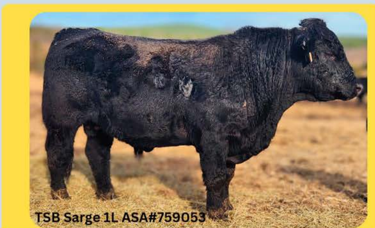
TSB Sarge 1L ASA#759053

TSB Sarge 1L - Sire of Lots 5, 6, and 7 Yearling Bulls. Sire of all calves at side of dam for Southern Eagle Ranch. Service sire for bred females.